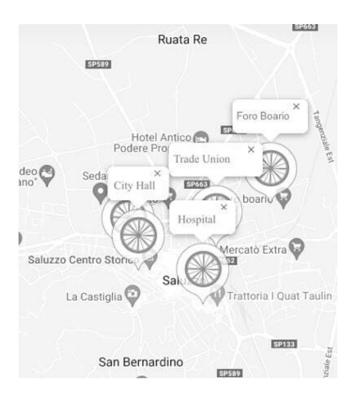
FIGURE 2 Map of the city of Saluzzo with some points of interest for migrant farmworkers.

the municipality of Saluzzo, as institution, entered the field autonomously by renovating an old military building and creating a hub [Foro Boario] not only to accommodate people in Saluzzo but also to use this as the main center [for workers relocation]; if the workers had the contract in nearby municipalities, they were moved in these other minor centers in the "widespread reception" ("accoglienza diffusa"). (Int.1, social worker)